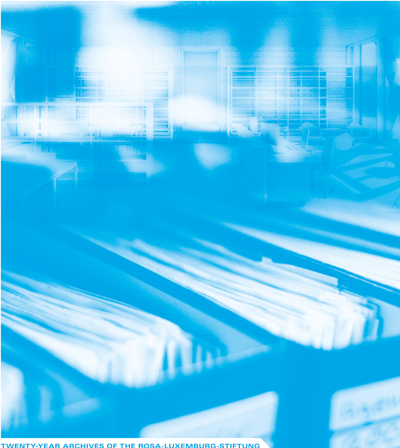
TWENTY-YEAR ARCHIVES OF THE ROSA-LUXEMBURG-STIFTUNG