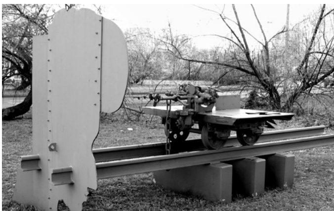
The monument Von der dicken Berta zur roten Rosa (From fat Berta to red Rosa) by the Israeli sculptor Igal Tumarkin stands on the centre lane of Bundesallee at its junction with Spichernstraße. This site lies on the path that Rosa Luxemburg was taken along to Hotel Eden. A steel relief representing Rosa Luxemburg faces the fateful vehicle that transported the field gun known as "fat Berta".