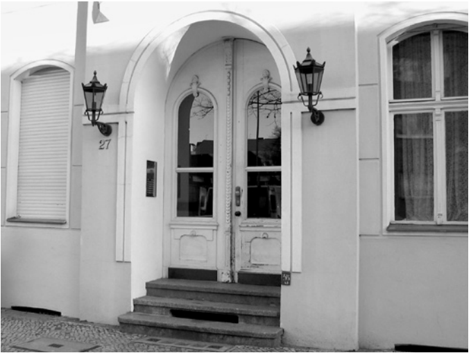
Rosa Luxemburg was taken from this house (Mannheimerstraße 27, at the time, Manheimerstraße 43) to Hotel Eden at what is now Olaf-Palme-Platz.